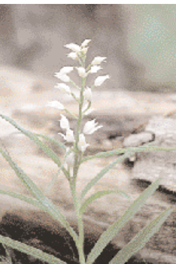
8. Sword-leaved helleborine

The habitat and species action plans will identify relevant current action and existing plans and put these in the context of the overall action required. Individual organisations and agencies such as the Environment Agency, district councils, Ministry of Defence and Forestry Authority will be encouraged and supported in the preparation of biodiversity action plans to cover their own areas of activity. In many cases, individuals responsible for the management of land may find it useful to prepare a plan which relates specifically to their own landholding, and which forms part of their overall business plan.