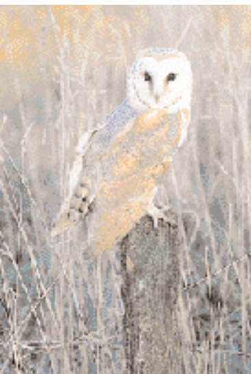
6. Barn owl

Implementation of the action will include a wide range of functions such as land-use planning, provision of grant-aid and land management. Each partner will have a particular role to play: for example, planning is the remit of local authorities; giving grants and incentives is one of the functions of the Ministry of Agriculture Fisheries and Food; land management is a primary responsibility of farmers; and community action can be fostered by bodies such as the Hampshire Wildlife Trust and parish councils.