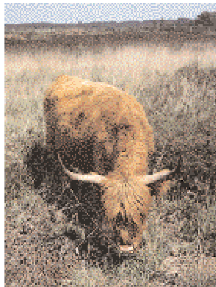
53. Grazing heathland