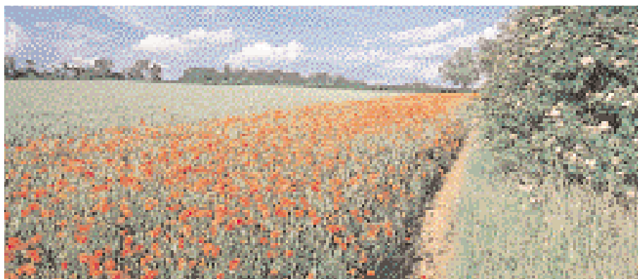
52. Biodiversity at the field edge

Each plan should be seen as a working document. The plans will provide a reference point to monitor progress at regular intervals and will be updated over time. Additional species may have plans prepared if the UK Action Plan recommends them or if dictated by local circumstances.