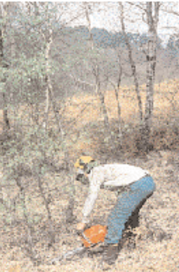
56. Clearing scrub on heathland