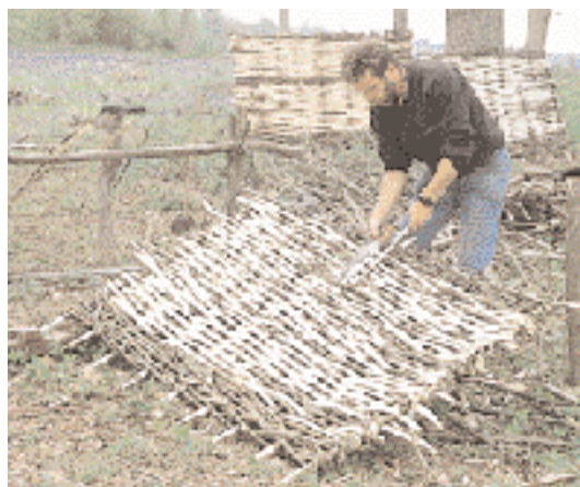
54. Using hazel coppice