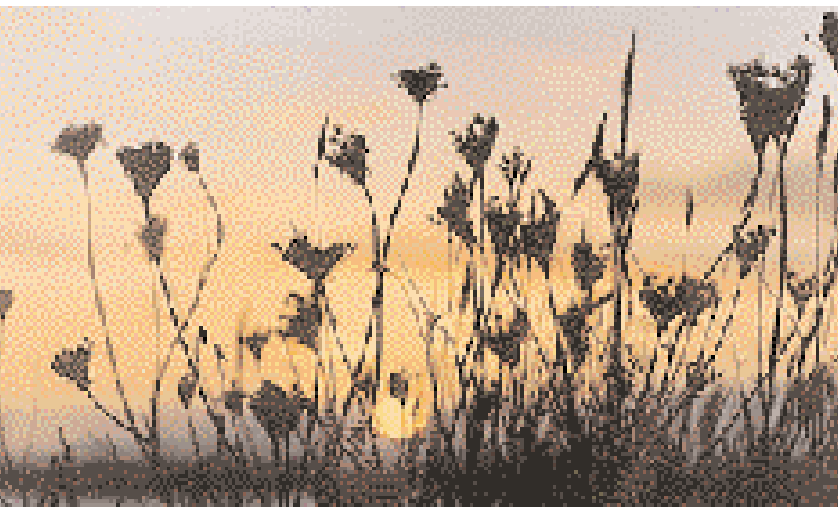
57. Coastal vegetation