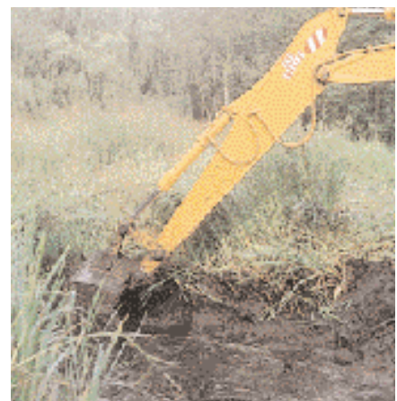
55. Pond restoration